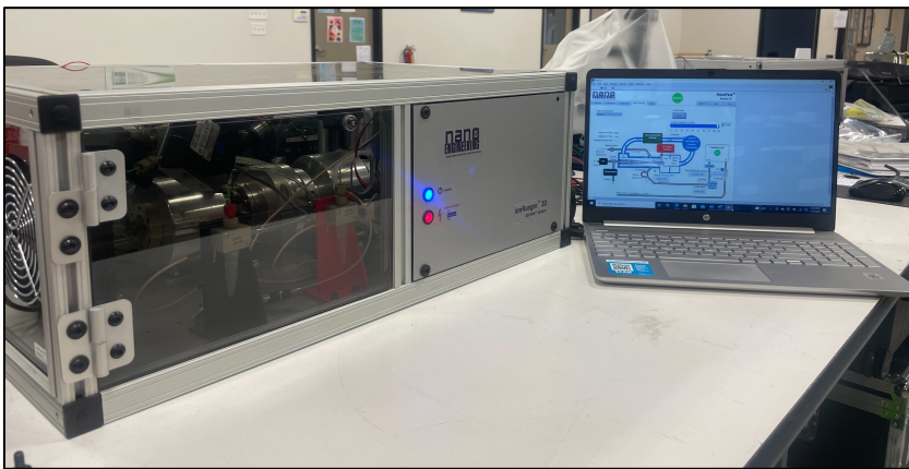
NanoRanger Front View with Laptop Control S/W

NanoRanger™ is a high resolution, transportable and programmable Electro-spray Differential Mobility Analyzer (ES-DMA) system designed for research in instrumentation, particle detection, virology and macromolecular biology. NanoRanger is optimized for high resolution characterization of particles with mobility size of 20-250nm, with demonstrated capability to distinguish between particles in this range differing by 2% or less. The system comes with a choice of electro-spray emitter to address a variety of applications. NanoRanger™ v0.6 features three separate inputs (Eppendorf vial, capillary*, and external air), is compatible with multiple particle detectors (CPC, Electrometer) and pairs with mass spectrometers (“ES-DMA-MS”). NanoRanger™ is 100% computer controlled with industry leading test algorithms and digital camera-assisted electro-spray tuning.